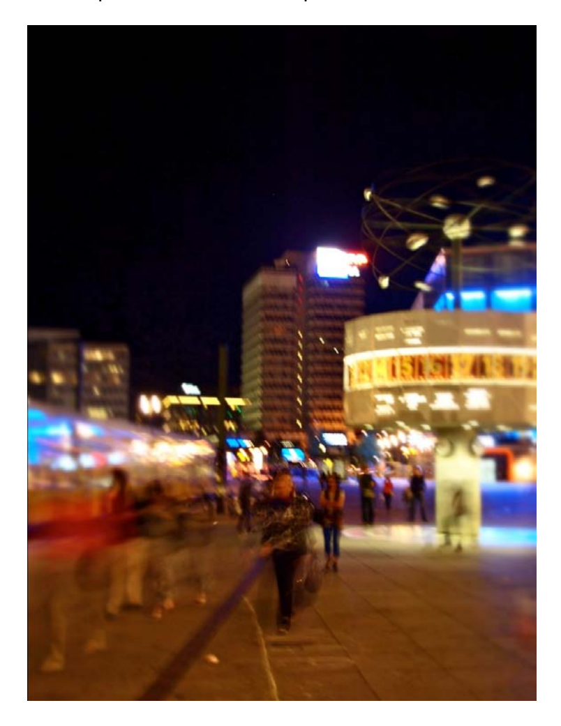
Berlin Alexanderplatz: 'Adults in Transition'

To become a members of ESREA fill out the form available at www.esrea.org and send back to the secretariat. When the application has been received, the secretary will send an invoice for the membership-fee which should be paid within three weeks.