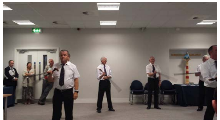
The Shandon Shillelagh Club demonstrate their self defence skills