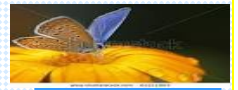
Even the smallest wonders can place a song in your heart

Postal Address 60 Ramsay Street, Toowoomba