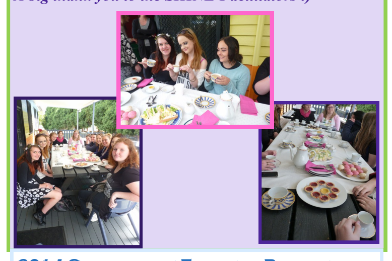
2014 CARNIVAL OF FLOWERS PARADE

A big thank you to the SHINE Facilitators:)