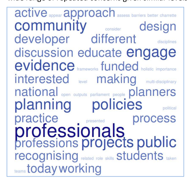
Figure 6. The most frequently raised issues by those participants who think that there is evidence for change towards better placemaking practice

A majority of the participants thought that there is evidence that professional culture and practice is changing in response to calls for better place-making. But about a third of these sought to qualify this by making 'Yes but ....' statements. Only a small minority thought that there was no evidence that this was happening. However, there is no simple story to be told here. Nor is there a single magic bullet that participants point to for delivering better place-making. Instead there is a very wide range of repeated concerns given similar levels of importance.