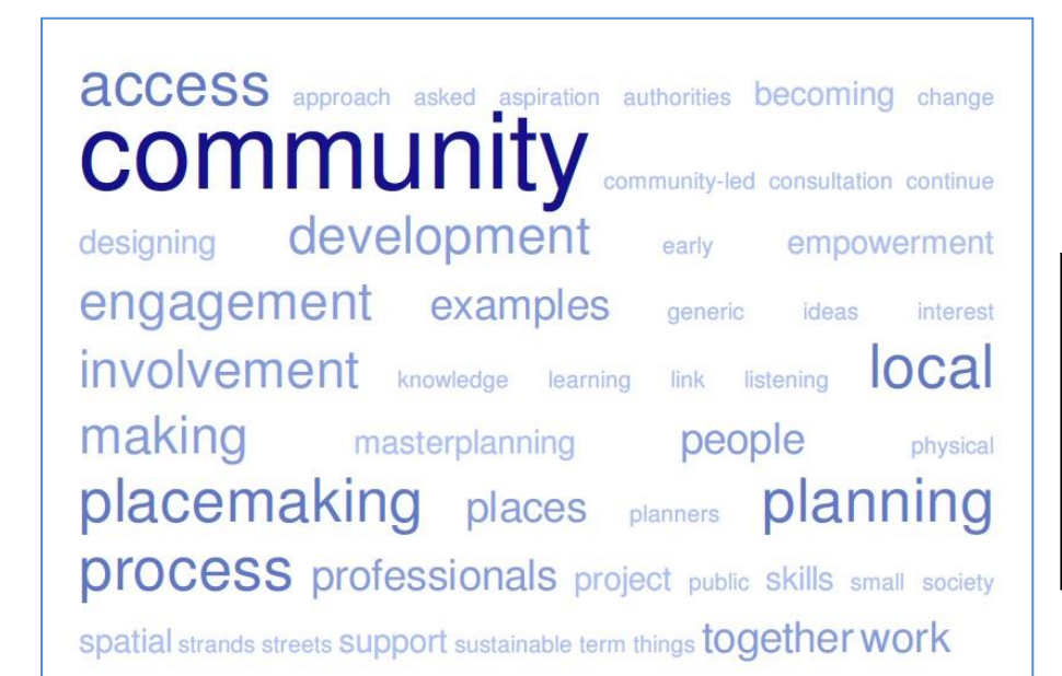
Figure 1. The overall priorities given to issues as reported by the discussion groups (Combined result for all groups by frequency of mention to all three questions)