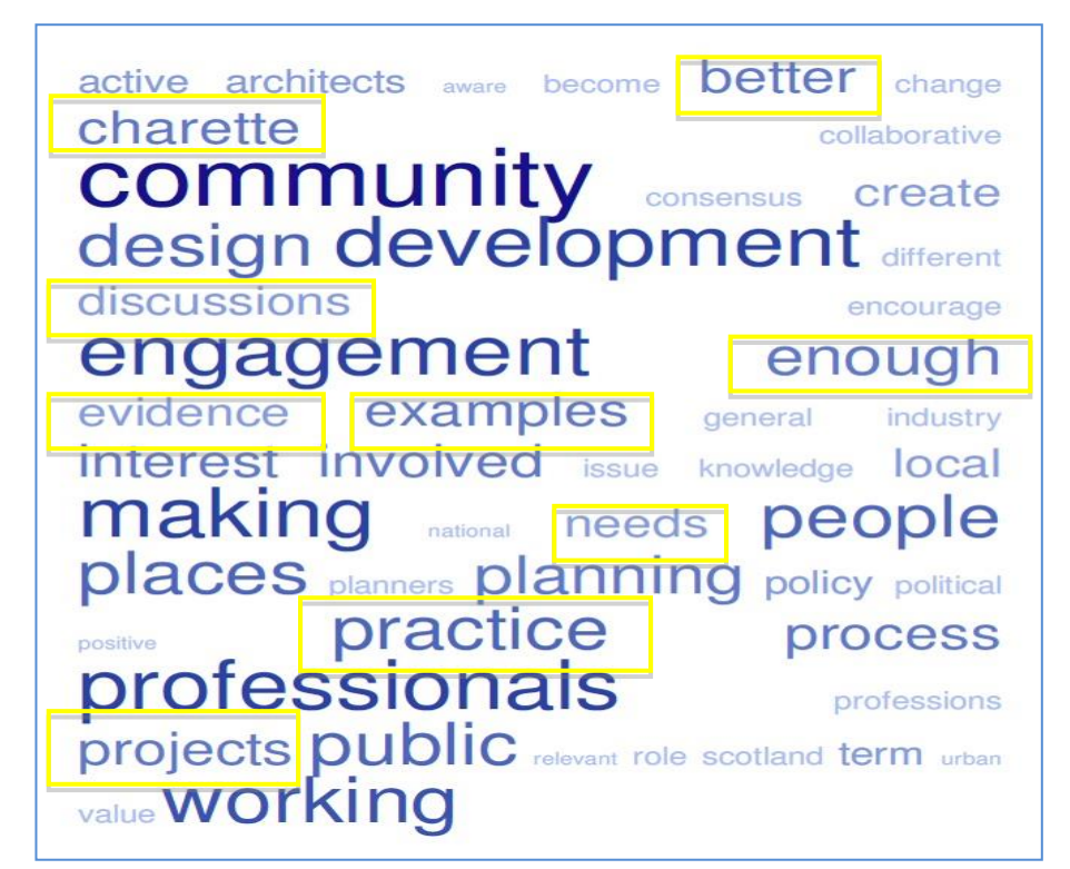
Figure 5. The most frequently raised issues by individual participants

Twenty of symposium participants completed and returned the pro-forma. (Not all of them answered every question.) Figure 5 combines all of the participants' responses, shown as a Tag Crowd.