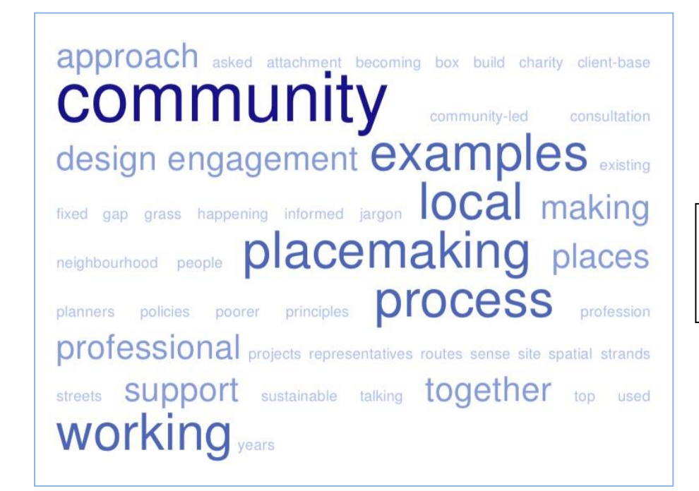
Figure 2. The priority given to issues for Question 1 as reported by the discussion groups

In turn, behind these stands were concerns about involving and engaging people in development through working together. Figure 2 shows the four groups' combined responses to this question, again as a Tag Crowd.