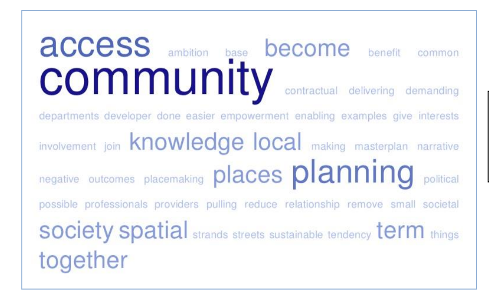
Figure 4. The priority given to issues for Question 3 as reported by the discussion groups

Figure 4 shows the four groups' combined responses to this question.