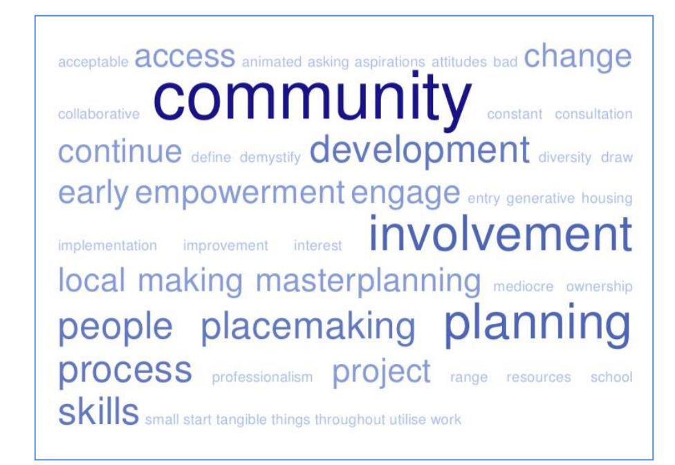
Figure 3. The priority given to issues for Question 2 as reported by the discussion groups

Figure 3 shows the four groups' combined responses to this question.