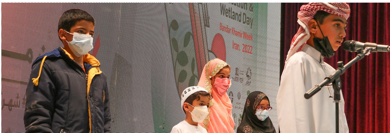
Child students of old and active Islamic Center of the City