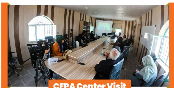
CEPA Center Visit

CEPA Center is the heart of the management and direction of volunteers and their activities. The festival has been driven by CEPA Center.