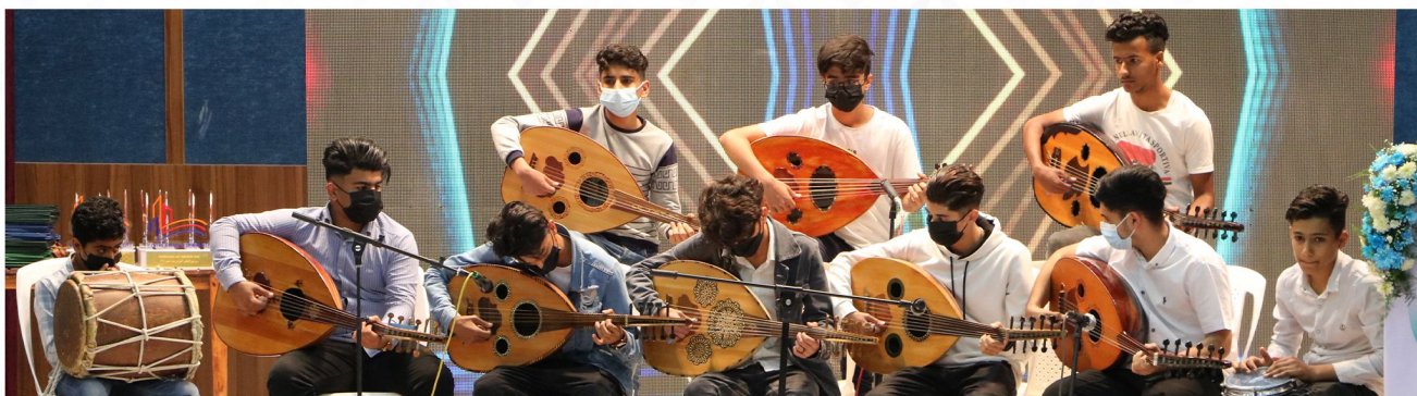
Young Oud Players from Oud Center Academy of Bandar Khamir