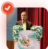
Secretary general of Iranian commission for UNESCO