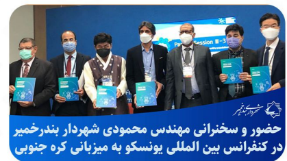
Report on presence of Mayor of Bandar Khamir in the fifth international conference of Learning Cities in Korea