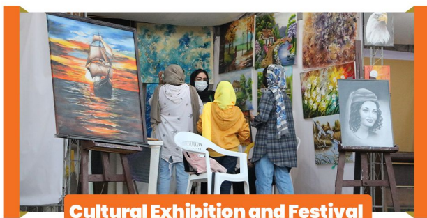
Cultural Exhibition and Festival

Here is an overview on what happened during the Festival that lasted a week and for the first time, it was named as Cultural Week of Bandar Khamir.