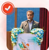
President of Hormozgan University