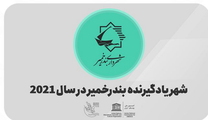
Annual Report of Bandar Khamir Learning City