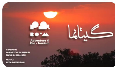
Short Clip about beauties of Bandar Khamir