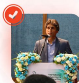
Mayor of Bandar Khamir