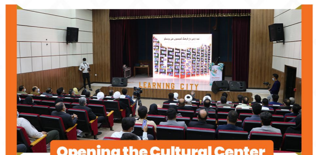
Opening the Cultural Center

CEPA Center is the heart of the management and direction of volunteers and their activities. The festival has been driven by CEPA Center.