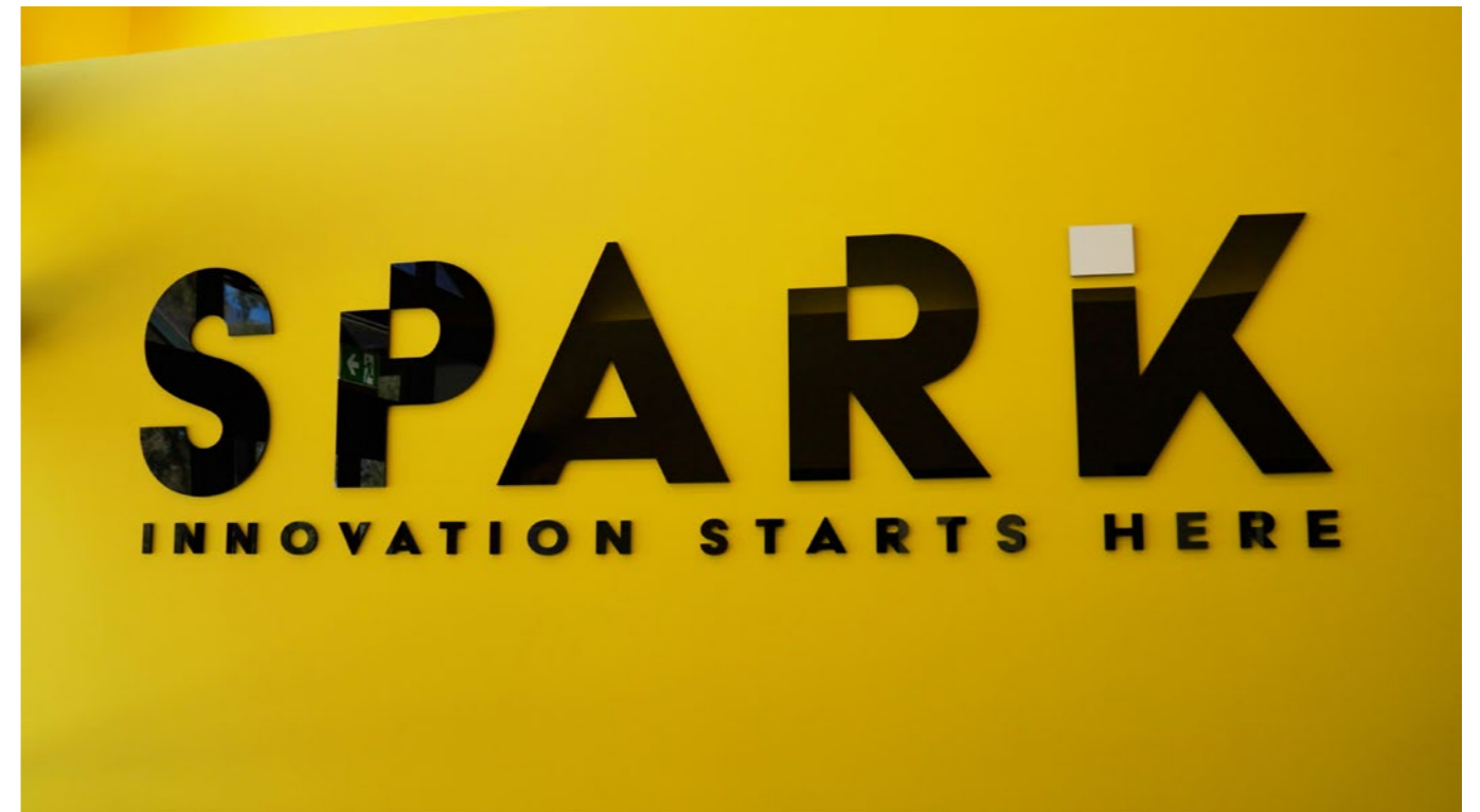
SPARK - Wyndham City's Innovation Hub