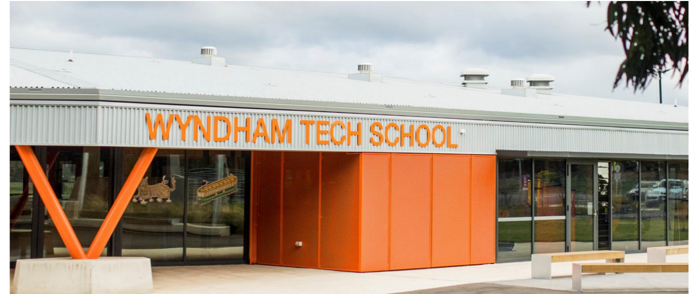
Wyndham Tech School