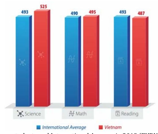
Fig. 1 PISA score of Vietnamese students and International Average in 2018 (EVBN, 2018)

Participating for the first time in PISA in 2012, Vietnam's 15-year-olds performed on par with their peers in world-renowned Germany and Austria (OECD, 2012), and then on par with Australia in 2015 (FactsMaps, 2015). Although an official ranking of Vietnam is yet to be published for 2018, the country test scores were amazingly high.