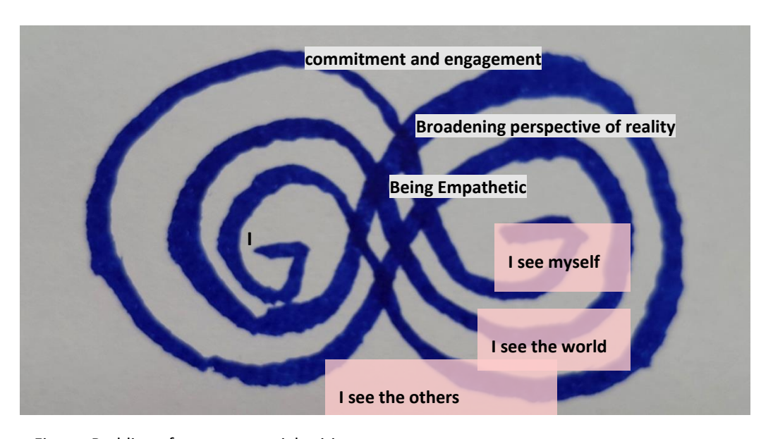
Figure: Budding of entrepreneurial spirit