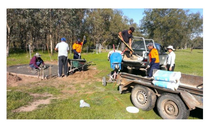
Above: August 2015, Bhutanese community working bee setting up infrastructure

Between 2010 and 2015, over 1,500 Bhutanese refugees settled in the Albury Wodonga region. Searching for avenues to thrive in their new home, representatives of this community approached Parklands Albury Wodonga for an area of land on which to create a community farm. Parklands drew on a network of supportive businesses and community groups to help them make that vision a reality.