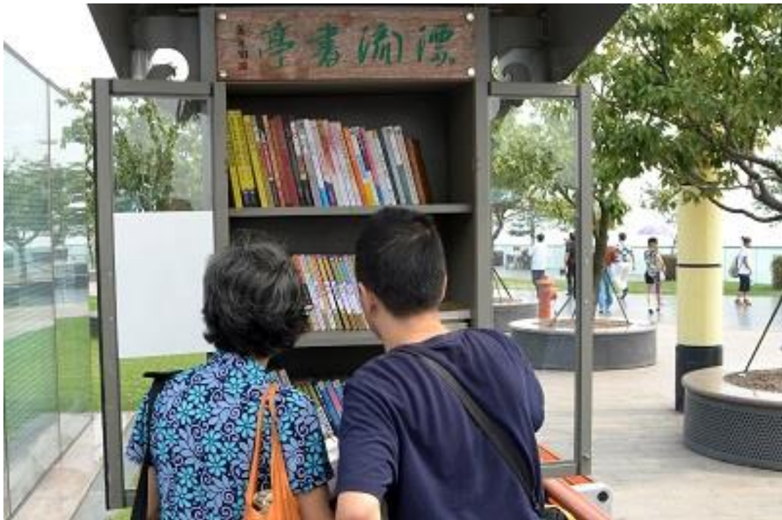
Mobile Bookstall in Hangzhou

Hangzhou's 3L (Lifelong, Lifewide and Lifedeeep) educational system and 6W (no matter Who, When, Where, Why, access to What information in Which way) learning city.