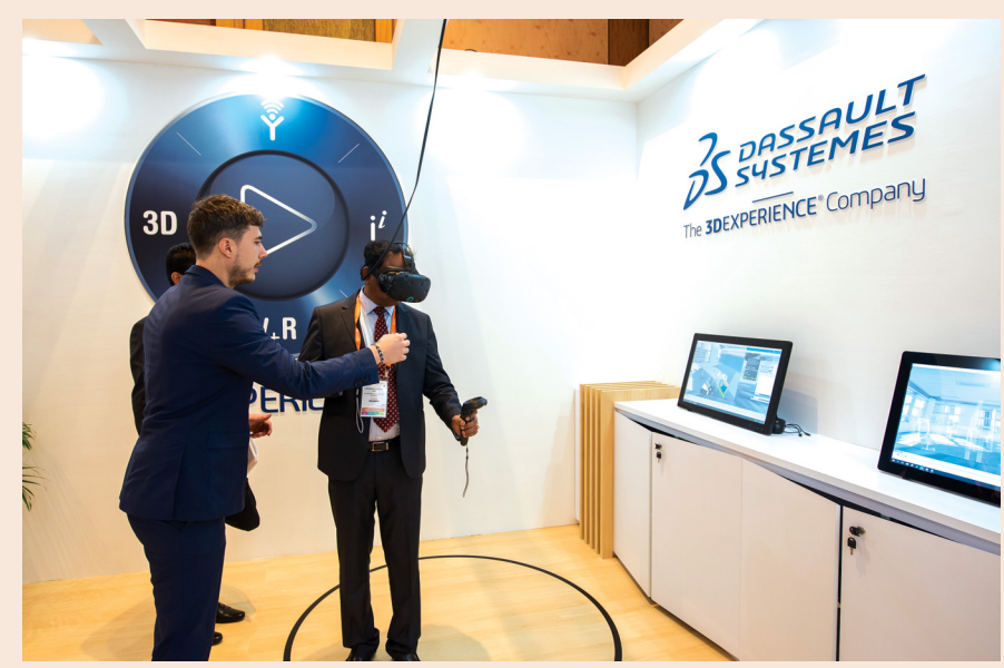
Sponsor booth at Cities @ City Solutions Singapore

Specially designed half-day tours offer World Cities Summit participants first-hand perspectives on how policies and ideas can be implemented successfully. Each site visit is a unique learning experience that provides a behind-the-scenes look at real issues.