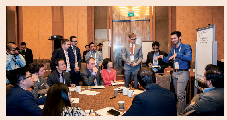
Discussions at the Young Leaders Symposium

The Symposium is an annual gathering of WCS Young Leaders, a group of change makers from diverse sectors who shape the global urban agenda. These passionate leaders discuss ways to tackle challenges such as planning for urbanisation and making cities more inclusive by creating better access to opportunities like affordable housing, sustainable transportation, accessible education and meaningful employment.