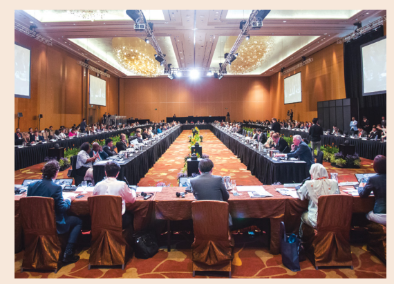
Mayors and city leaders at the 2018 WCS Mayors Forum

A by-invitation-only annual event, the WCS Mayors Forum is a global platform for mayors, city leaders, and frontrunners of international organisations to discuss pressing urban challenges and share best practices.