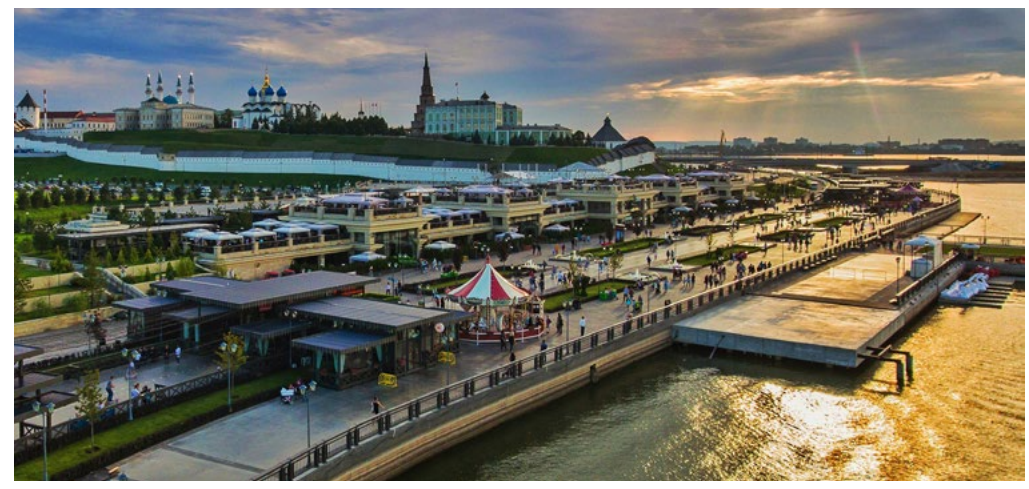
Cities of Antwerp (right) and Kazan (left) using public spaces to build trust in societies