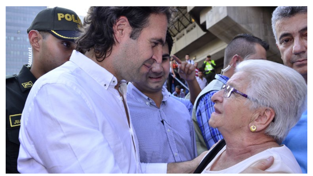
Federico Gutiérrez, Mayor of Medellín, engaging with a fellow citizen

Deputy Mayor Gotzone Sagardui explained that Bilbao uses Citizen Security Workshops as a co-creation tool for solving conflicts, planning security objectives, assessing their outcomes and deciding what specific issues need to be addressed. The workshops aim to create participatory forums in each district, make local people aware of police officers and their work, create spaces that directly engage citizens and build a stable public participation structure around security. Workshops have already started in two districts and the city's goal is to extend them to all neighbourhoods of Bilbao by the end of 2020.