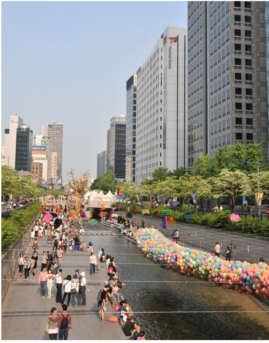
Lee Kuan Yew World City Prize Laureate 2018: Seoul, South Korea.