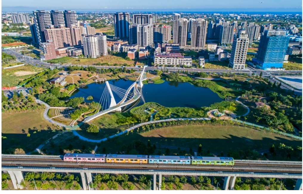
Cities of Suzhou (top) and Taoyuan (bottom) are working towards long-term planning for economic and environmental security.