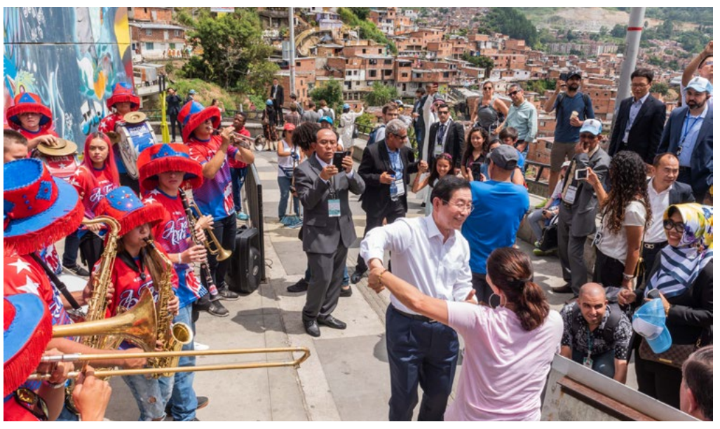
Park Won-soon interacting with citizens of Commune 13 in Medellín