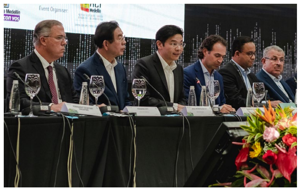
Mayors and city leaders at the World Cities Summit Mayors Forum 2019