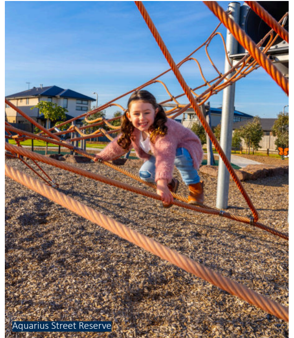
Aquarius Street Reserve