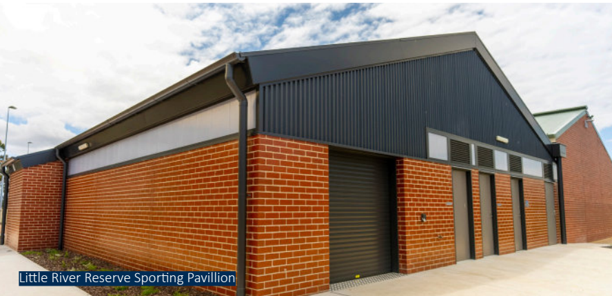
Little River Reserve Sporting Pavilion