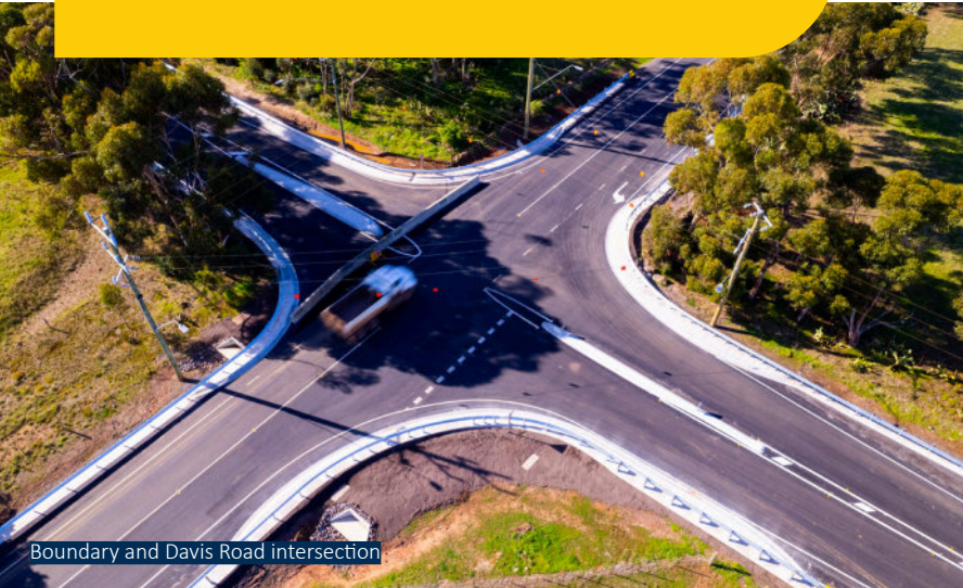
Boundary and Davis Road intersection

For more information on these and other projects around the City visit: www.wyndham.vic.gov.au/majorprojects