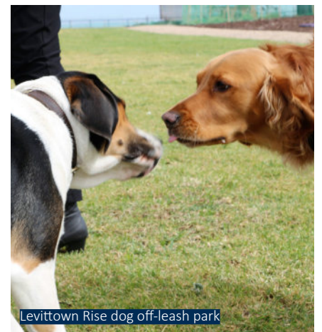
Levittown Rise dog off-leash park

Keep up to date with our capital works projects at: www.wyndham.vic.gov.au/capitalworksdashboard